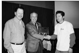
Most Resourceful Campaign Idea—Baldor Car Show

Most Resourceful Campaign Idea , Baldor Electric Company/ Car Show