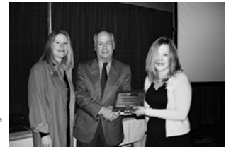
Franklin County Division Award—ATU—Ozark

Greenwood , Farmers Bank, Greenwood Public Schools