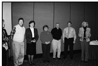
2004 Campaign Division Chairmen

Division Awards Based on community outreach, participation and giving.