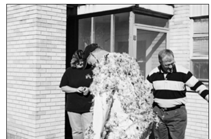
Special Fundraiser at Georgia Pacific-Manager getting "tarred and feathered".