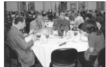
2003 Campaign Wrap-Up

Spirit of Caring Award -Agency staff and board that partners with UW through volunteer support of all UW activities.