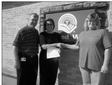
Georgia Pacific check presentation