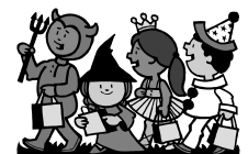
Danielle and children at YLG Halloween party