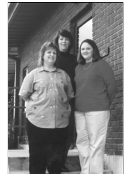
City of Fort Smith cooks at United Way fund-raiser