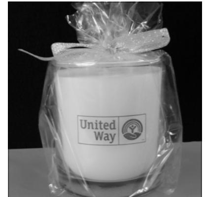
See sample at United Way office.